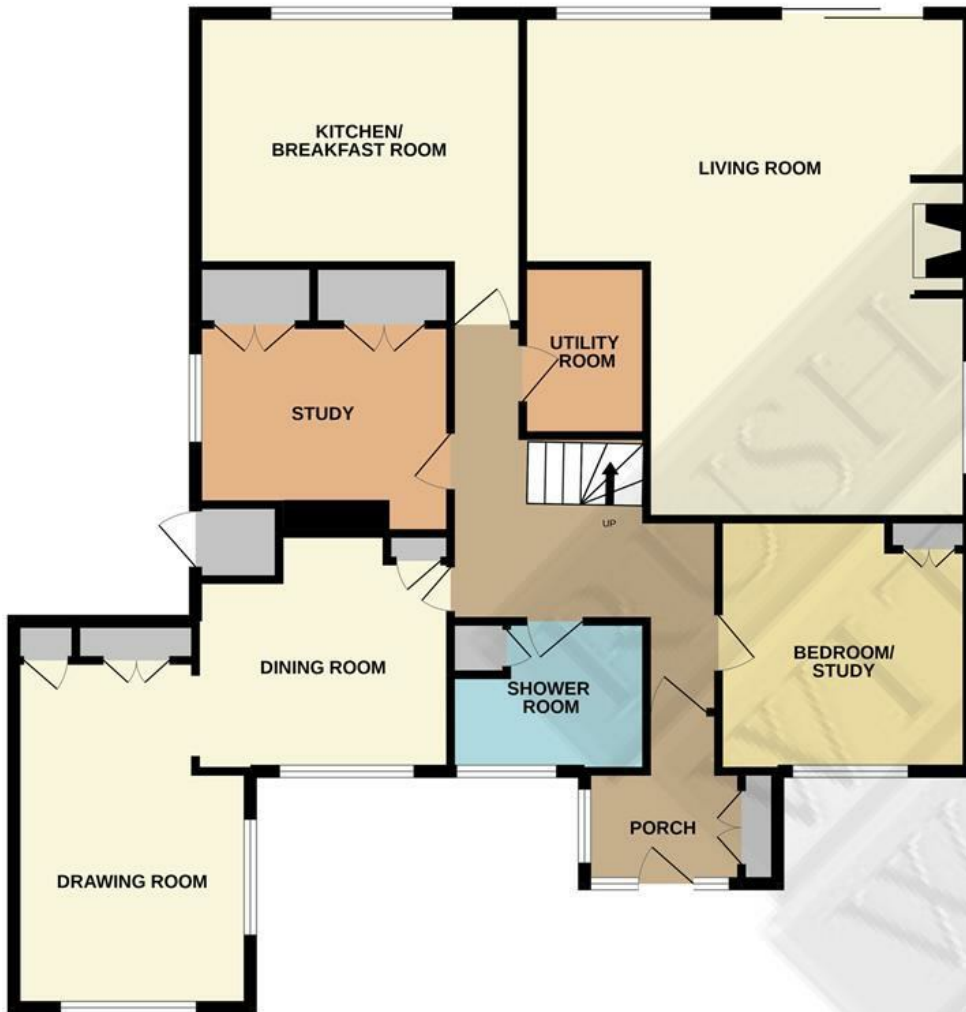
1ST FLOOR 1072 sq.ft. (99.6 sq.m.) approx.